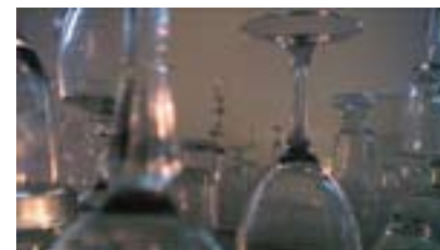
Detail of 'Tomorrow is our permanent address' installation by Suki Chan