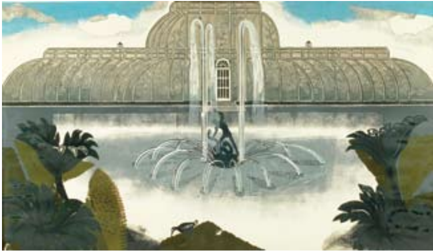
Edward Bawden (1903-1989) 'The Palm House', Kew Gardens, 1950